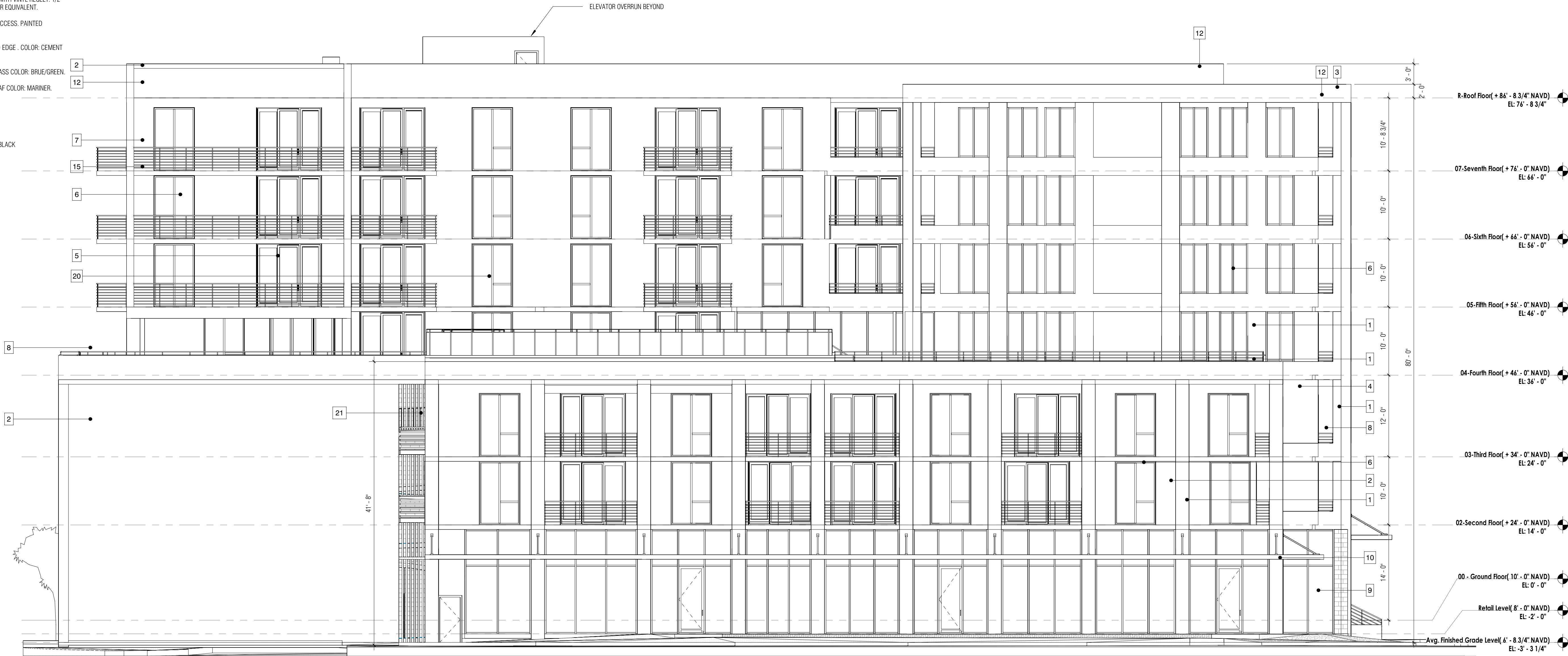
1 04 OVERALL WEST ELEVATION A - 10 Scale: 1/8" = 1'-0"

GLAZING NOTE: ALL GLAZING TO BE TRANSPARENT AND OF LOW REFLECTIVITY TO ALLOW VIEW OF HUMAN ACTIVITY WITHIN THE BUILDING.